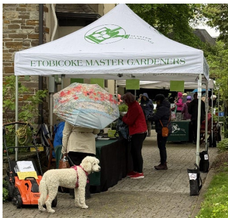
EMG Spring Plant Sale featuring lots of keen home gardeners

Details: In spite of the cool temperatures, gusty winds and lashing rain, many interested gardeners turned out to support our Plant Sale. Native plants were very much in demand, as well as tried and true garden staples such as hostas, phlox, echinacea, etc. The tomatoes, peppers and other edible “starter plants” grown by EMG members were also quite popular. We provided support with garden advice, assistance in plant selection, and commiserating about the cold and wet spring we have all been experiencing!