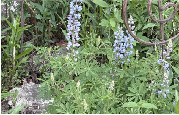
Master Gardeners of Ontario Newsletter