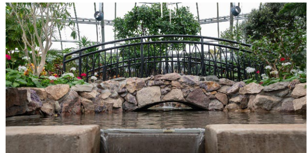
Bridge in the main area