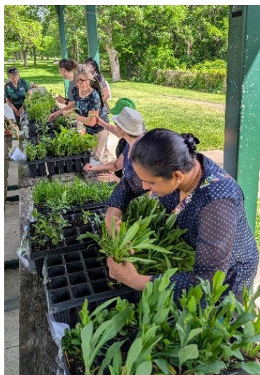
Getting the plants ready