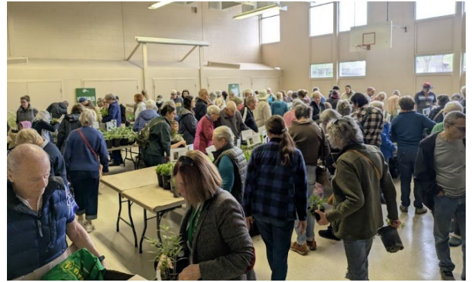
Opening Hour Crowd!