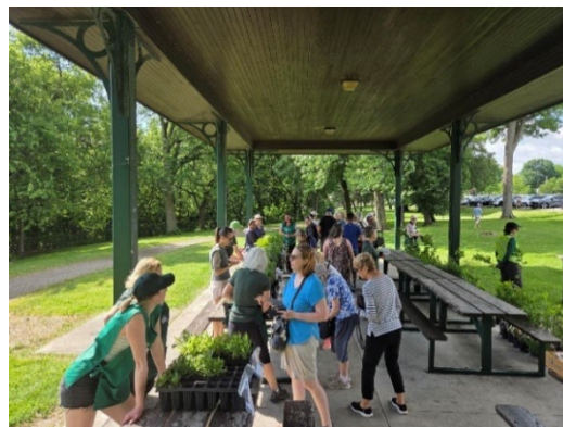
10am and half the plants were sold!

This was a wholly native plant sale held on the grounds of Dundurn Castle in Hamilton. HMGs sourced all the plants from Verbinnen's, a wholesale native plant nursery just outside of Hamilton. The sale was hectic. Half the plants were sold within the first hour—then things heated up again at the end.