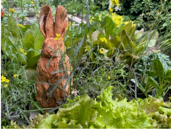
A stern terracotta bunny guards a lettuce patch against any real bunnies looking for a snack.