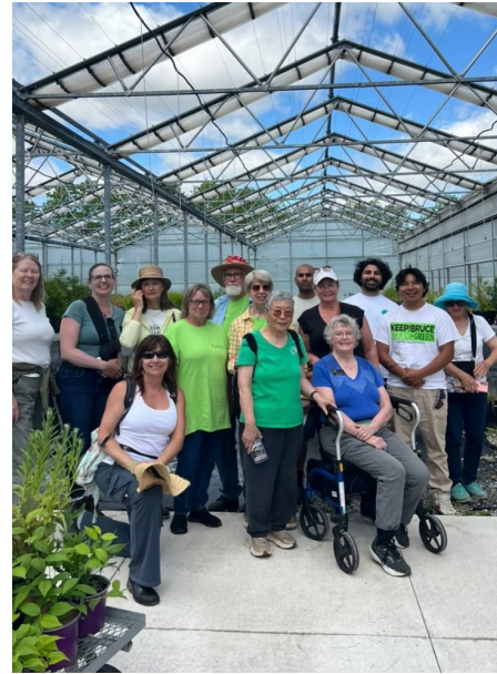
Mississauga MGs at Kayanase