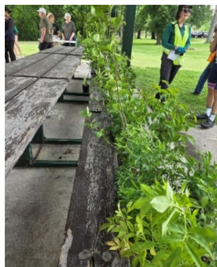
Last of the trees

A happy customer with space to fill cleared out the rest of the trees at the end of the sale, including a red oak tree, and we were only left with a few perennials.