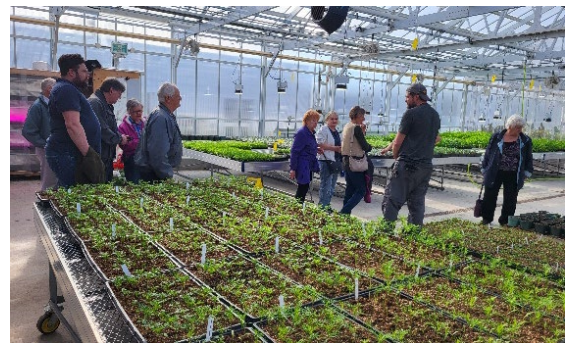
MGs in the greenhouse

The Conservatory staff is also responsible for planting annuals and perennials at various city parks, and we were fortunate to view all the plants in the 3 new greenhouses before they were planted. They grow and supply over 64,000 plants each summer, including 58,000 annuals and 8,000 perennials.