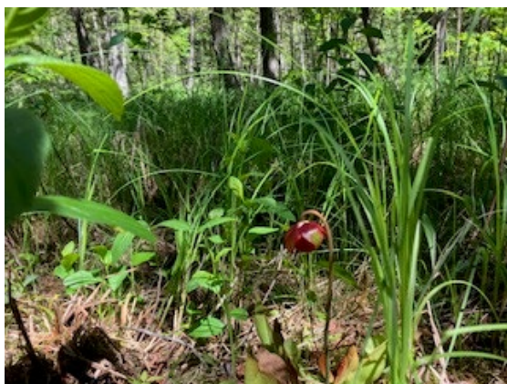
Purdon Pitcher Plant

Details: One of our group's favourite places to visit is the fen at Purdon Conservation Authority. Our June meeting was early, and spring was cool, so this visit was missing our beautiful orchids. As always there are many other interesting plants and birds and blackflies.