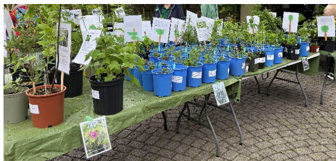
Descriptively labelled plants divided into native and non-native plants