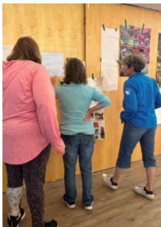
Participants share their plans and designs