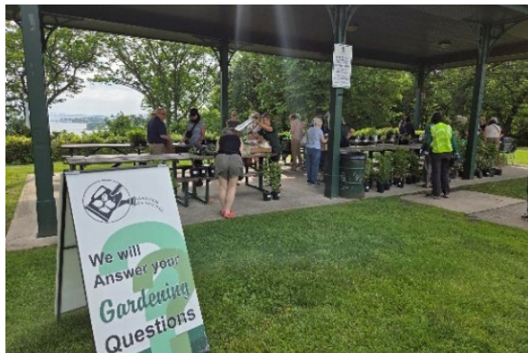
Early morning set-up