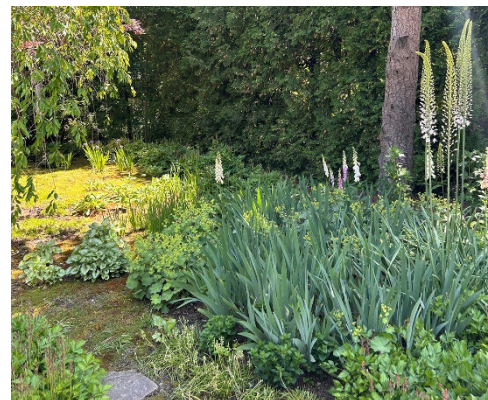
Foxtail lilies and foxgloves stand above a shady area at one of the gardens featured in the annual Shaw Garden Tour

The event is organized by the Shaw Theatre Guild and is the largest fundraiser of the year for the Shaw Festival. The guild is a volunteer group that raises money for the theatre company. Ticket sales from the tour help pay for Shaw productions and children’s programs.