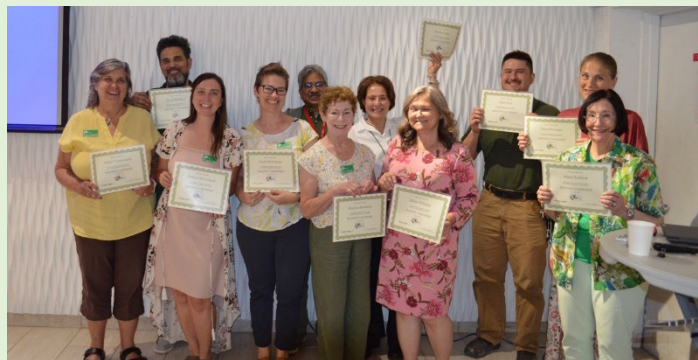
Toronto Master Gardeners is pleased to congratulate 13 new graduates in 2026!