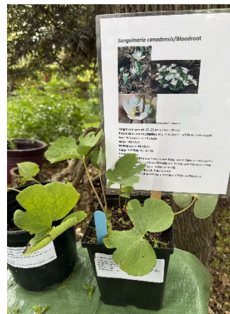
Bloodroot (Sanguinaria canadensis) - a favourite!