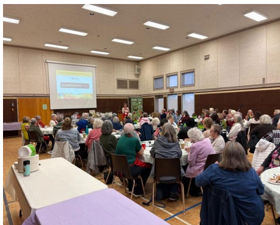
Everyone enjoying the day

Details: A Day for Gardeners was held on April 25 th . Our yearly fundraising event was sold out. It was a chilly and rainy day - not ideal for gardening but perfect for learning and talking about gardening. We had over 100 garden enthusiasts who were excited to be indoors learning about Healthy Gardening, Gardens, and the Birds & the Bees!