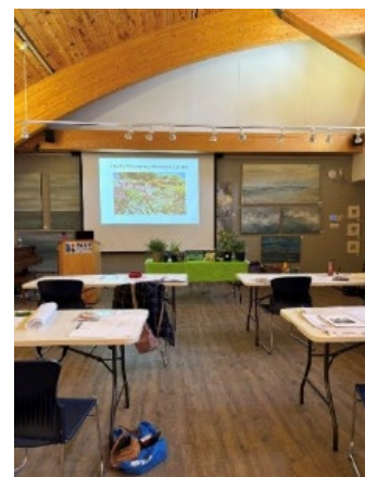
The session set-up at the library

Meaford and Thornbury libraries have just wrapped up their 3-part A to Z gardening series that guided participants through the process of planning and designing a garden, including plant selection, budgeting and installation. Summer programs will involve sessions on soil composition, soil type, overall soil health, and tips on composting.