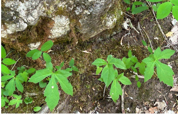
A Master Gardeners of Ontario Newsletter