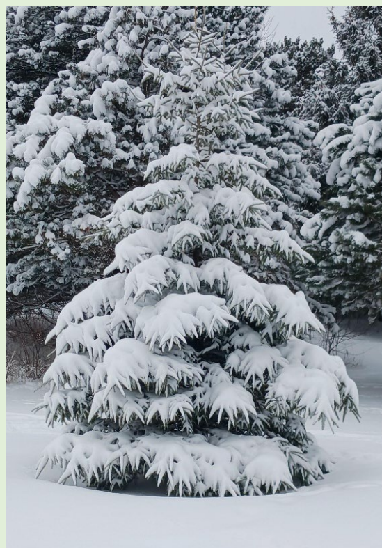
Brookmeade Park, Mississauga on 15 Jan. 2026