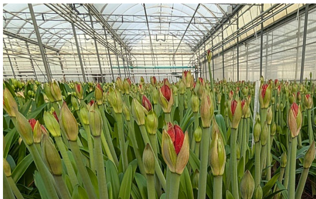
A field of amaryllis stretches into the distance at a Prins Grow greenhouse in Vineland Station in Niagara. They are grown from October to Valentine's Day and sold mainly for cut flower arrangements.

MG Betty Knight put together some information to ponder while possibly admiring your own amaryllis that may be brightening your home this winter: