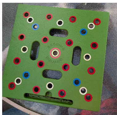
Seed Spacer template

you simply use the appropriate colour to plant your seed.