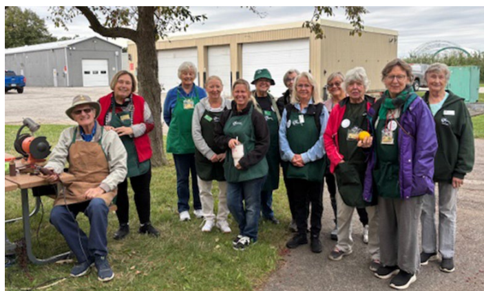
A good group of volunteers helped man the tables on the day of the plant sale and with the set up the day before

The event is always well attended, usually with a lineup outside before doors open. It is the largest fundraising event for the Niagara MGs each year.