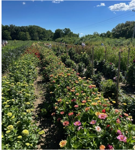
Workshop participants picking flowers in Erin's flower fields at The Garlic Shed