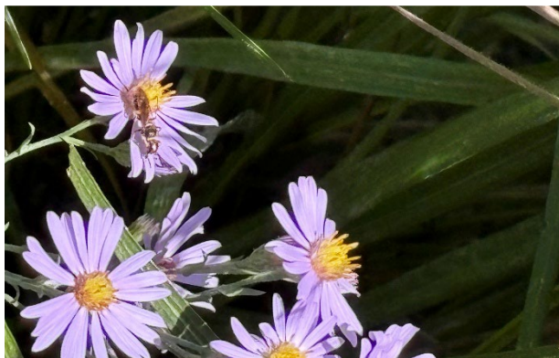
Newsletter of the Master Gardeners of Ontario