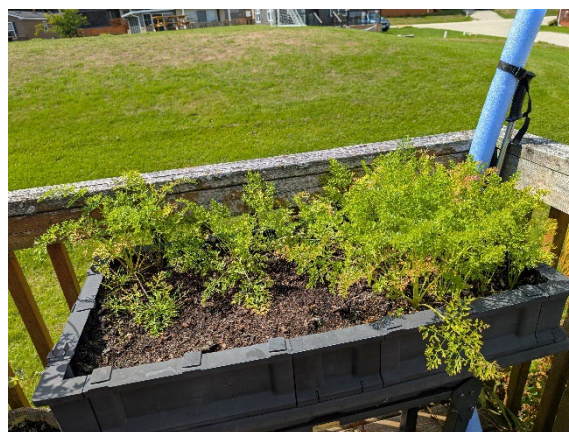
Trug 1 with carrots