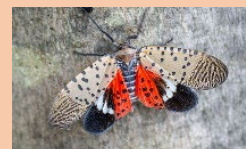
SLF – CFIA