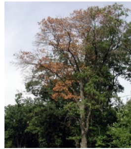
Oak wilt disease in an oak tree. Photo credit: Joseph O'Brien, USDA Forest Service, Bugwood.org https://www.canr.msu.edu/news/oak_wilt_diagnosing_and_preventing

How You Can Help: The CFIA would like Master Gardeners to share this message with the public and our members.