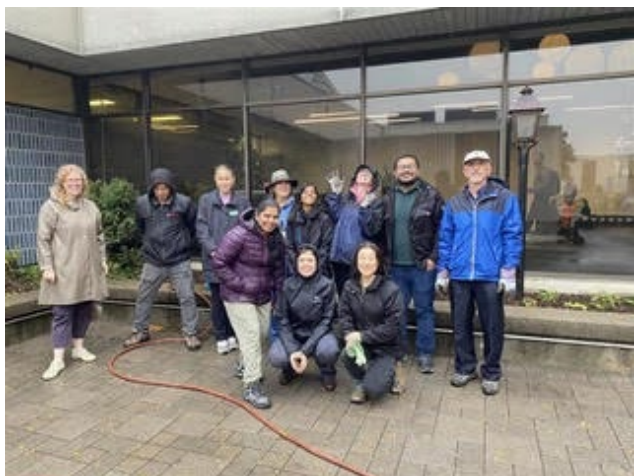
Enbridge