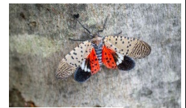
SLF – CFIA

Also check for Spotted Lanternfly (SLF). Canada is preparing for the potential arrival of the SLF, present in the United States and getting closer to the Canadian border. The Spotted Lanternfly would be devastating for Canada's wine, fruit, nursery and forest industries.