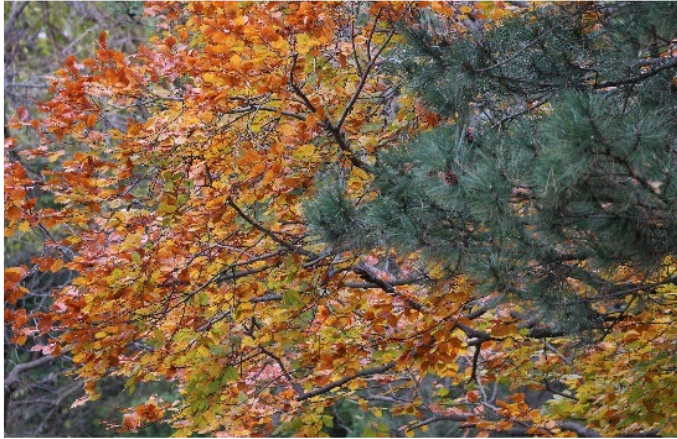
Newsletter of the Master Gardeners of Ontario