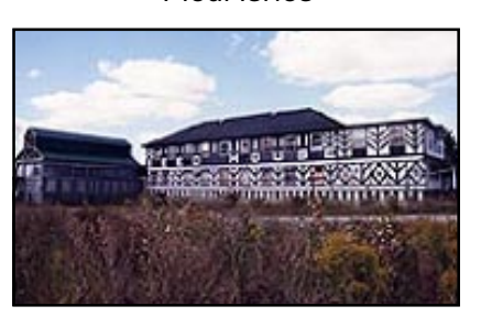
The familiar building is gone and the business has moved but the site of the Dominion Seed House in Georgetown blooms once again. Story, page 2