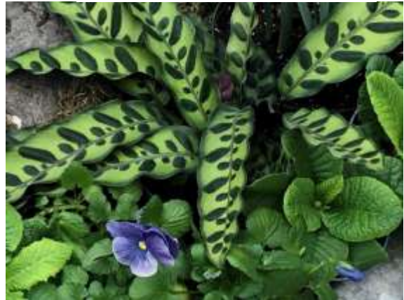
Calathea lancifolia with Pansies