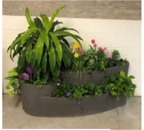
A tropical planter with the promise of Hamilton spring

The following pictures of spring bulbs planted amongst the tropicals show the promise of what Spring Tide might have been. Again we can only wait until next year.