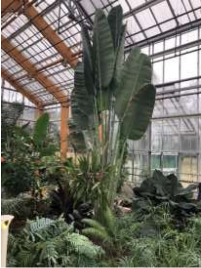
The large Banana Tree

Here are a few more residents of the greenhouse.