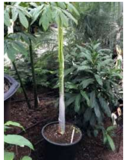
Young Arums as yet unnamed

When Arums are grown in captivity they are given names.