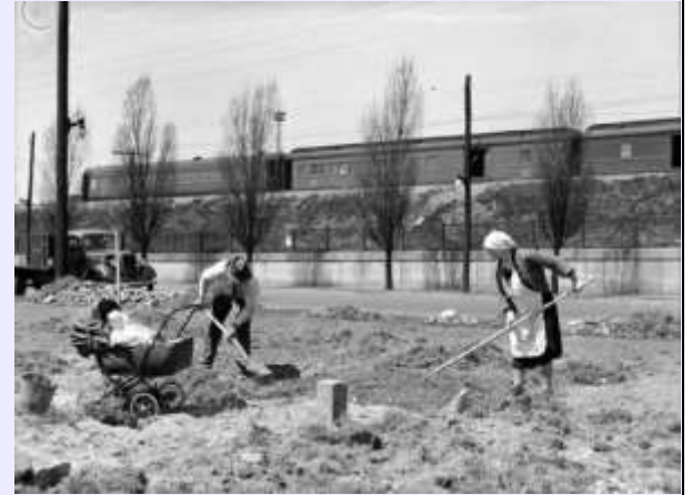
This photo is of a Victory Garden on Fleet Street in Toronto, May 9, 1940.

I hope that everyone who is able to will grow food for the many, many people who are in need. Please spread this message to all gardeners you know.