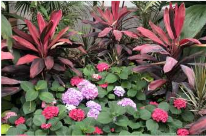
Newsletter of the Master Gardeners of Ontario