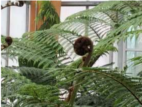
The Australian Tree Fern unfurling a frond