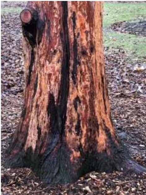
Why it's called the Redwood Tree

Of the over 2000 trees including 87 species in Gage Park there are a few huge old beech trees that have been fenced off to help preserve them. The estimate is that they are between 200 and 300 years old.