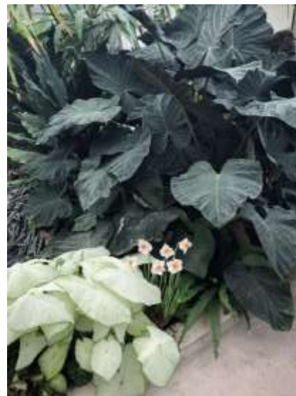
Daffodils peeking out from a few tropicals.