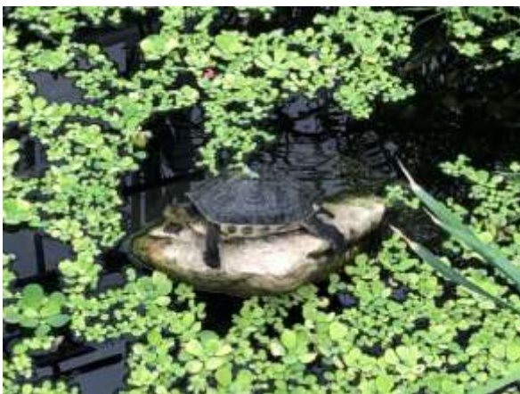
One of the resident turtles