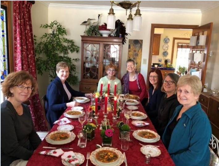
Good food, good company, & good dishes!

At our April meeting we were thrilled to welcome three new members and two other people who are interested in joining! All five were asked how they found out about us and the answers were: four from our website, one from a horticultural society, and one from our RBG event. So our next task will be improving our website to make it both attractive to new members and helpful to the public.