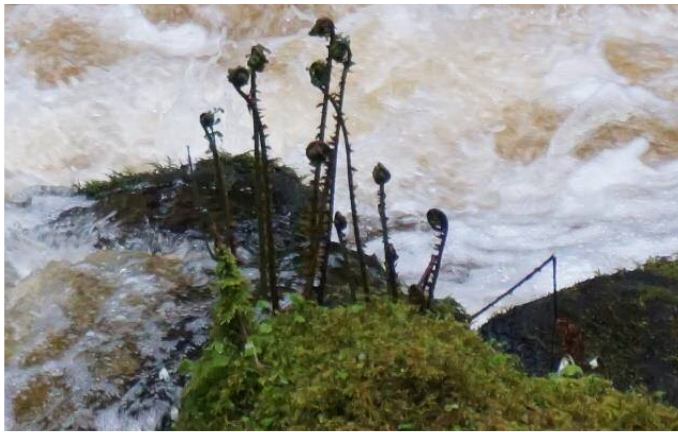
Newsletter of the Master Gardeners of Ontario