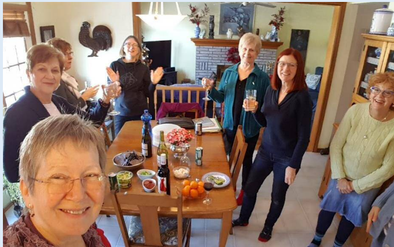
Enjoying appetizers and wine at the Annual Review Party!

Well first of all, we’re rocking that Annual Review! Last year, we opted to record hours and data on a spreadsheet located on a ‘cloud’ to facilitate data entry. We asked members to submit hours three times a year via email – June, September and January. Four members who have ‘permission’ to edit the spreadsheet shared the job of entering the data. This means that come January, all our data is tabulated and ready for the Annual Review “Party”! This event takes place in early January, a great time to socialize over lunch, and put the finishing touches on our report. This year we were even able to project the spreadsheet on the TV. We work through all the sections in the working copy of the Annual Review and brainstorm answers to the narrative section together. A ‘secretary’ inputs the information on a laptop which allows our coordinator to just copy and paste the information! Once that is complete, we discuss whom we could nominate for an Ontario Volunteer Service Award ! This format is not only enjoyable, but it makes more members aware of how the report works, hopefully demystifying this process for the next coordinator.