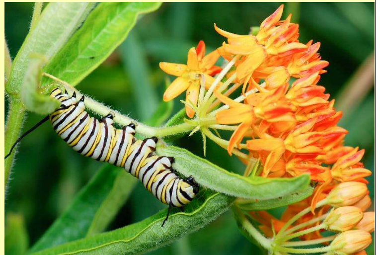
Caterpillar: Danaus plexippus ; Plant: Asclepias tuberosa ; Photo: Marshal Hedin, San Diego

Who knows what fascinating topic will be next!